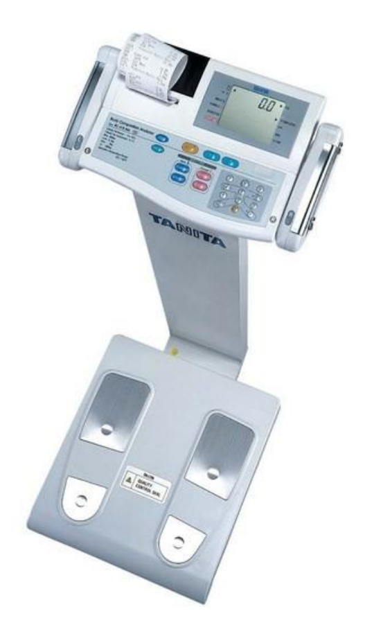
Figure 1: Tanita BC418MA body composition analyser

5.2: The Tanita BC418MA body composition analyser (figure 1) produces segmental readings of fat percentage, fat mass, fat free mass and predicted muscle mass for: right arm, right leg, left arm, left leg and trunk. Data are captured by direct entry into Vox from the Tanita analyser.