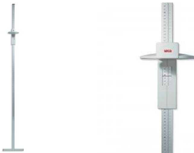
Figure 2.2.1: Seca 240cm height measure

2.2.9 The standing height measurement collected during this assessment was later used in the calculation of Body Mass Index ( BMI = \text{weight in kilograms} / \text{height in metres}^2 ), Arterial Stiffness Index (ASI), and in the Spirometry tests (since lung capacity varies with height).