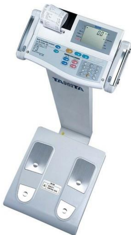
Figure 2.3.2: Direct entry of bioimpedance measures into assessment centre software